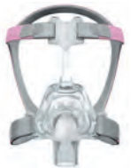
62128 Mirage FX for Her