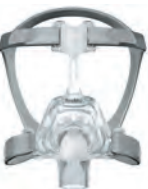
62118 Mirage FX Wide