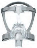
62103 Mirage FX